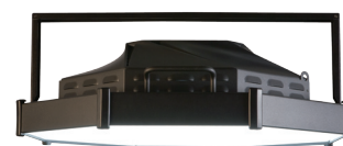
Low-profile hanging bracket